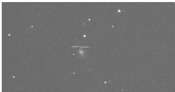
SN2005ep discovery image

Tim sent me the co-ordinates of the galaxy and the discovery image for reference. I punched the co-ordinates into my planetarium software and slewed the scope over to them. I quickly took a one second image. The field I was looking at was not the same.