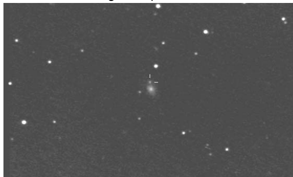
SN2005ep Confirmation image